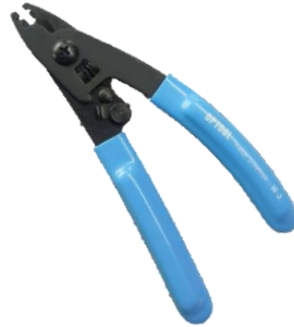
LTS-212/213 Fiber Stripper