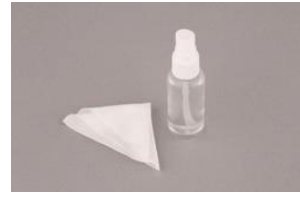
Dust-free cloth & alcohol bottle