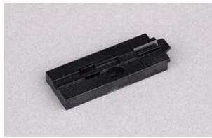
Fixed length device