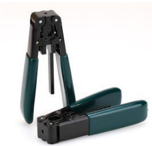
Model: LTS-242 FTTH Drop Cable Stripper