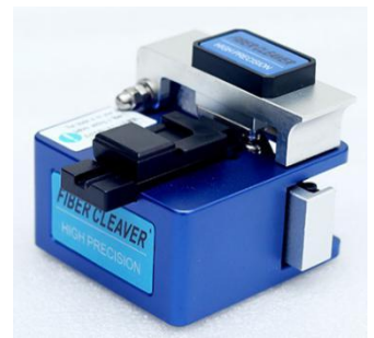
LFC-300 Fiber Cleaver